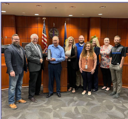
Ada County Procurement Team pictured with Ada County Board of Commissioners getting recognized for their 2022 award

64 cities, 41 counties, 36 special districts, 19 school districts, 12 higher education agencies, 7 state or provincial agencies and 2 others.